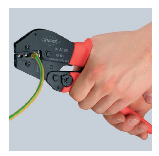
Third step: when greater hand force is required, such as e.g. when crimping 6.0 mm² insulated connectors, twohand operation is possible with the longer handles