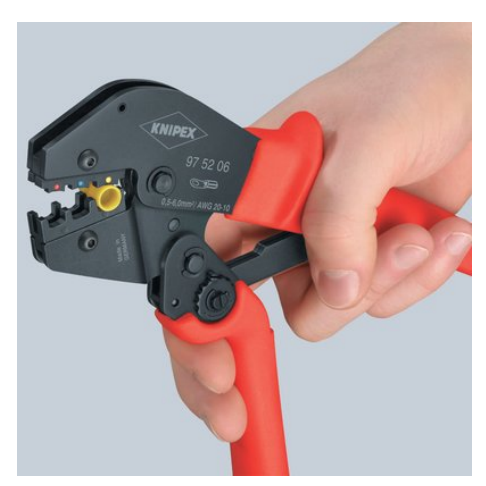
First step: move the handle with two fingers only until both jaws touch the connector to be crimped