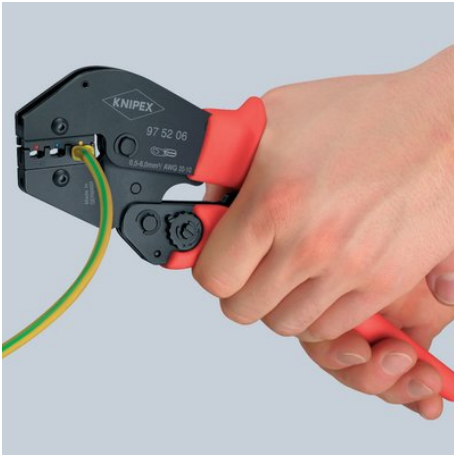
Third step: when greater hand force is required, such as e.g. when crimping 6.0 mm² insulated connectors, two-hand operation is possible with the longer handles