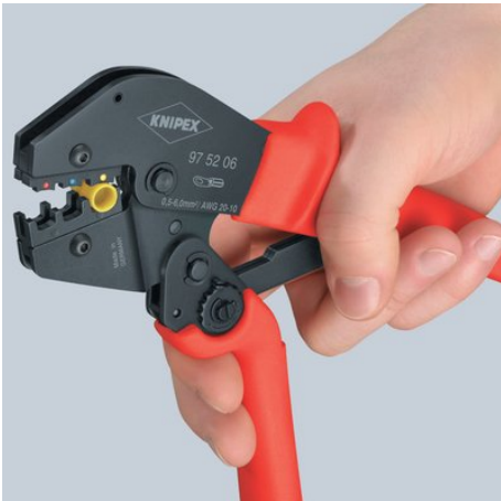
First step: move the handle with two fingers only until both jaws touch the connector to be crimped