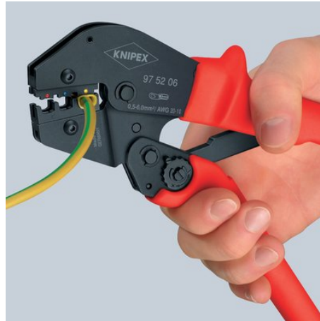
Second step: now use the whole hand for further crimping procedure