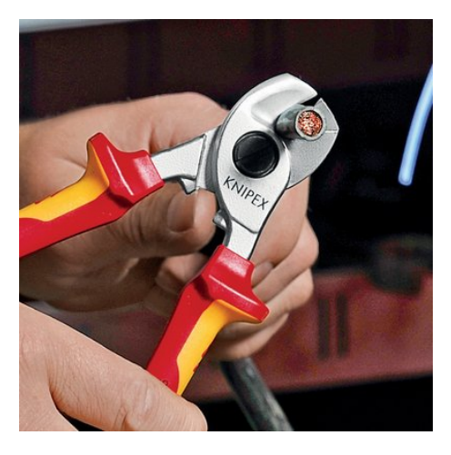
Cut performed with a Cable Shear: easy, clean cut without any deformation of the cable