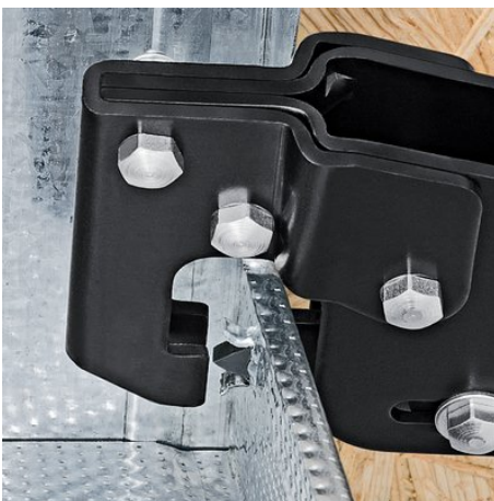
The punching tool is squeezed through the metal section sheets