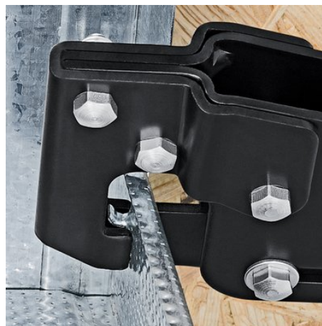
Setting the pliers for connection of two metal section sheets