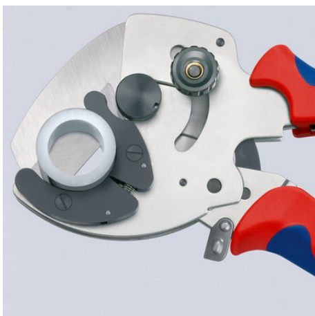
Clean cut of thick walled plastic and composite pipes