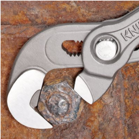
In operation on rusted nut with rounded edges