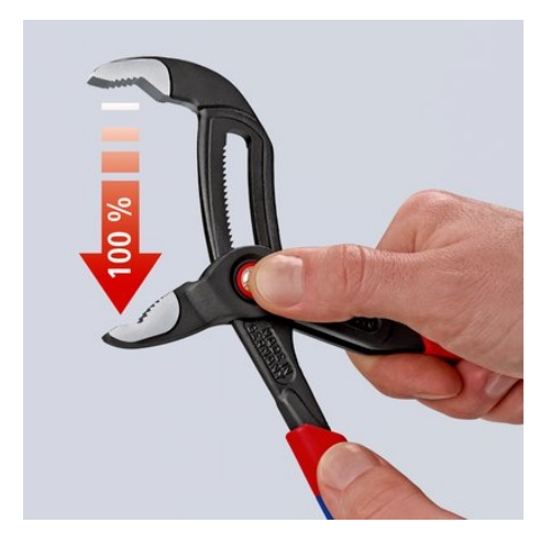
Press the button – open pliers completely