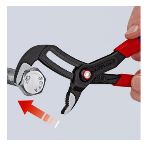
Position jaw – simply slide and close pliers