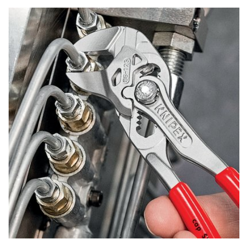
the mini pliers wrench for precision mechanics