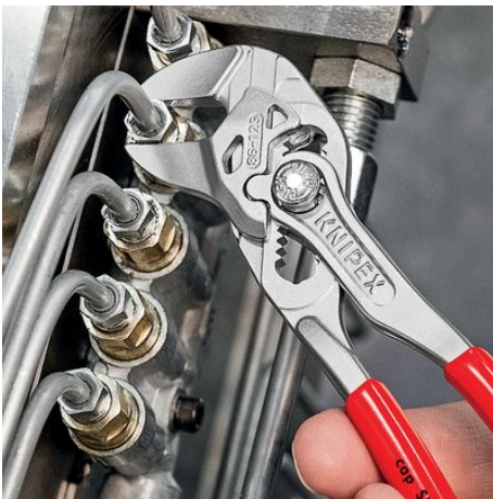
the mini pliers wrench for precision mechanics