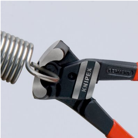
Extraordinary cutting performance: also for piano wire