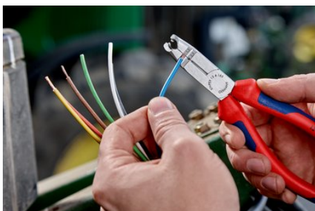
wire stripping holes for 1.5 and 2.5 mm 2 conductors