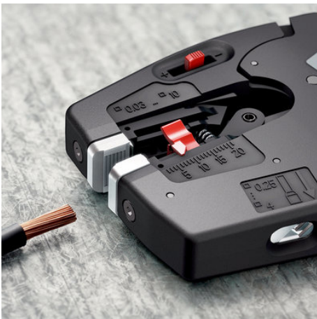
Automatic stripping up to 10 mm 2 .