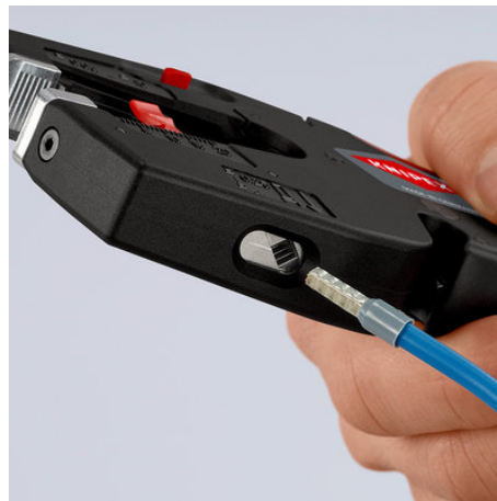
Square crimping point for wire end ferrules 0.25 - 4 mm 2