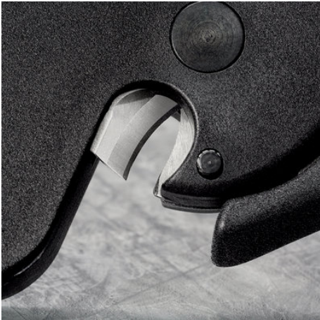
With cable cutter for conductors up to 10 mm 2