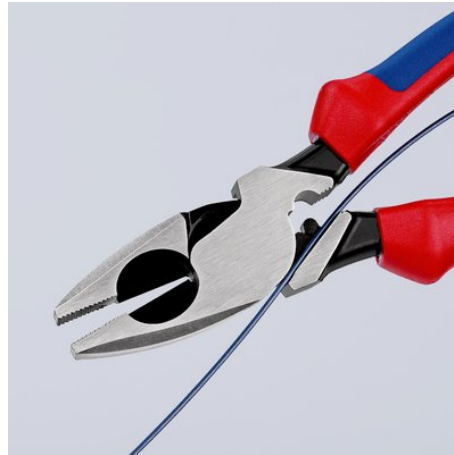
09 11/12 240: fish tape puller in the joint gap