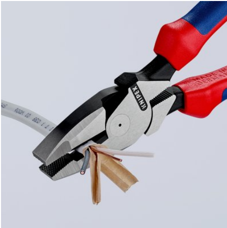
Long cutting edges for cutting flat cables