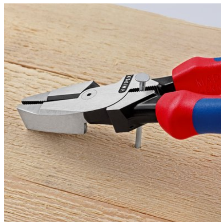
Gripping zone below the joint for powerful leverage