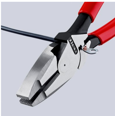
09 11/12 240: universal mandrel crimping area below the joint